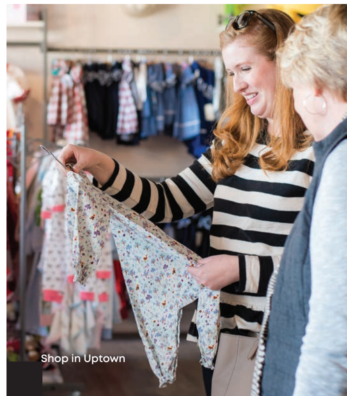
Shop in Uptown

There's always something happening in Uptown Greenwood. Restored buildings show off local restaurants, shops, galleries and events—there's something for everybody to enjoy.