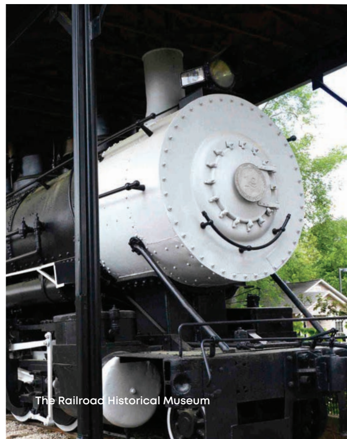
The Railroad Historical Museum

You can tour the birthplace of Benjamin Mays, and explore his monumental rise from sharecropper's son to one of the nation's most influential Civil Rights leaders. The site showcases several historic buildings and a museum.