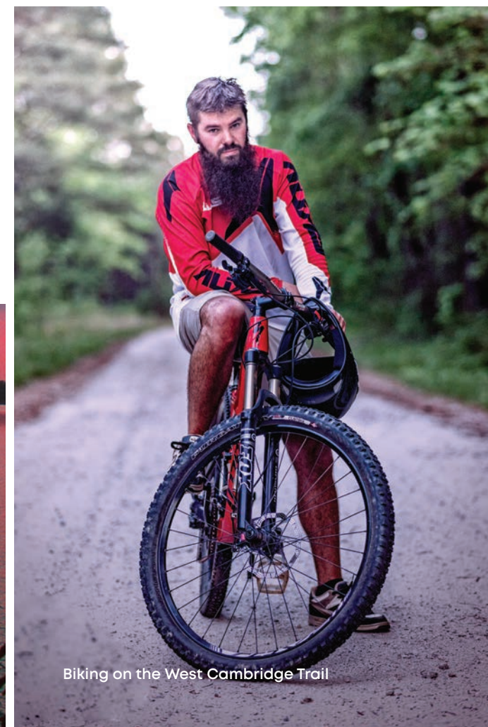
Biking on the West Cambridge Trail