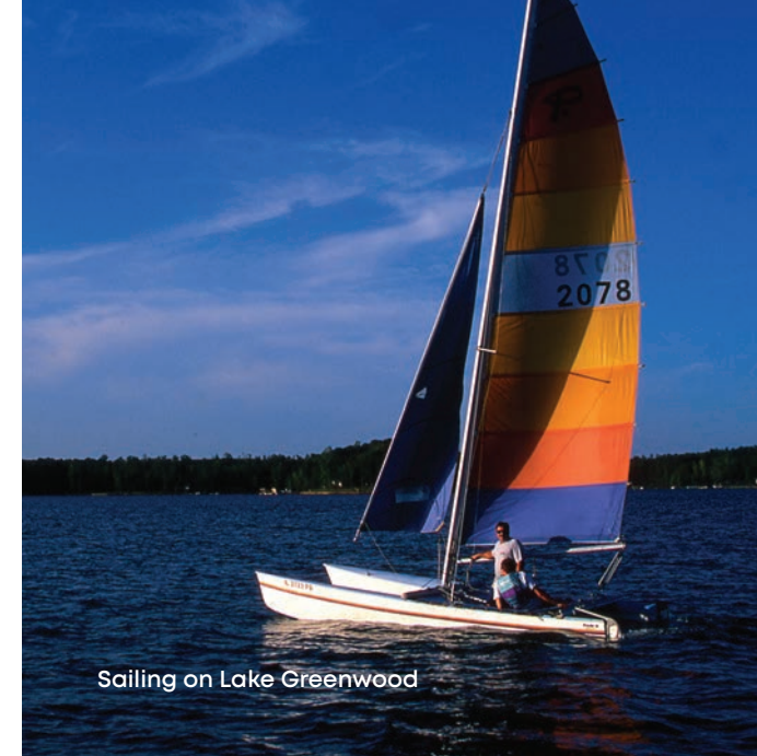
Sailing on Lake Greenwood

Several area parks offer opportunities to play outside. You'll find playgrounds, pavilions, picnic areas, and walking trails at West Cambridge Park, once a railroad-switching yard, and the small Magnolia Park in Uptown Greenwood. The new Grace Street Park has a walking trail, dog park, covered pavilion and restrooms. Wilbanks Sports Center and Recreation Complex features athletic fields, lighted tennis courts, jogging track, playgrounds, picnic shelters, Legion Baseball Stadium and a farmer's market.