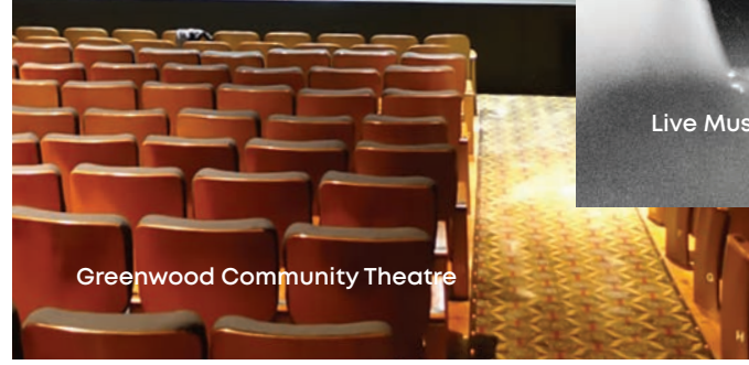
Greenwood Community Theatre