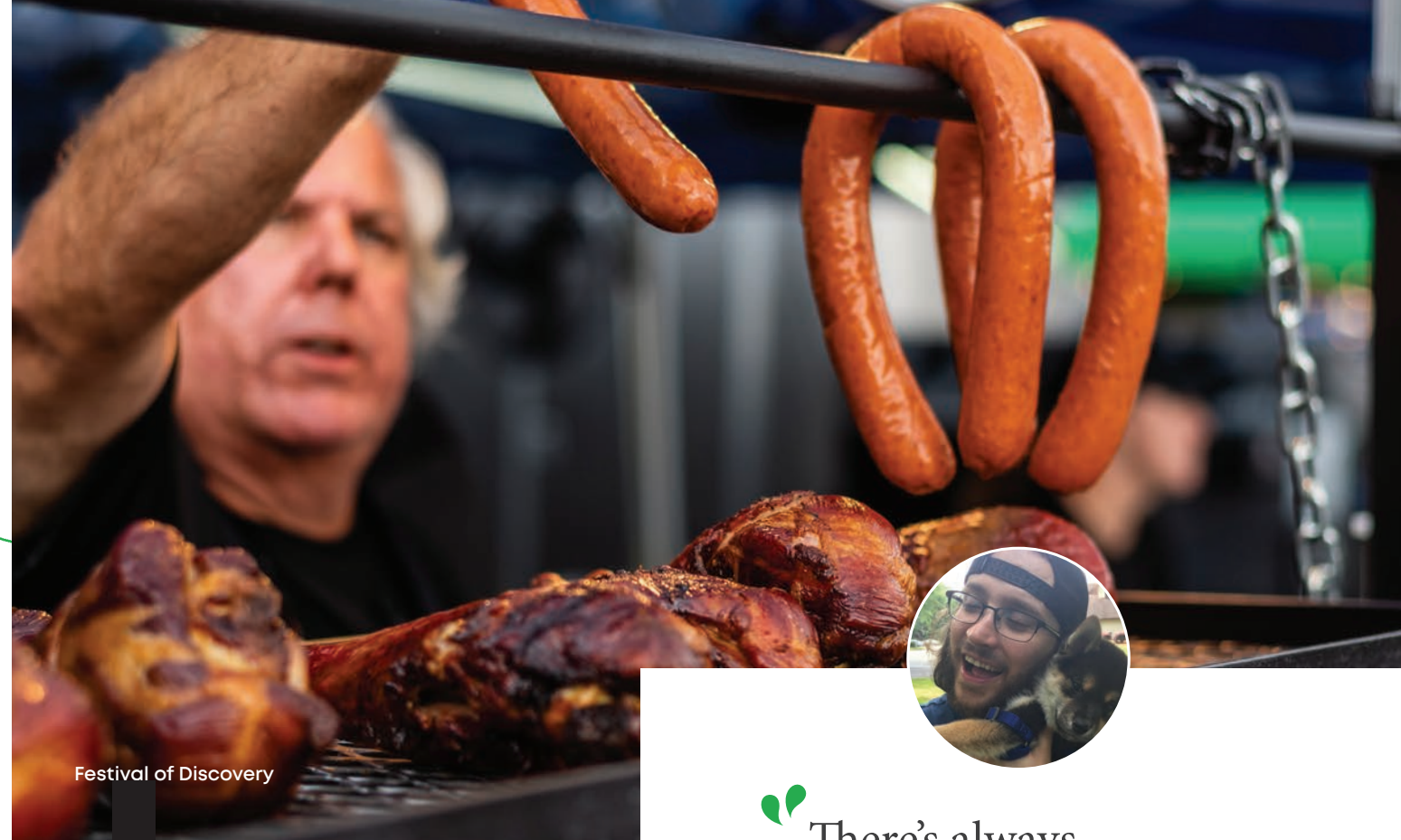
Festival of Discovery