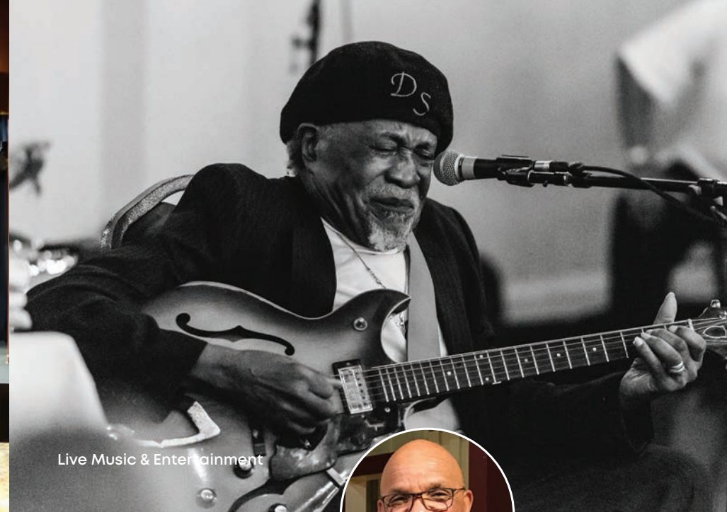
Live Music & Entertainment